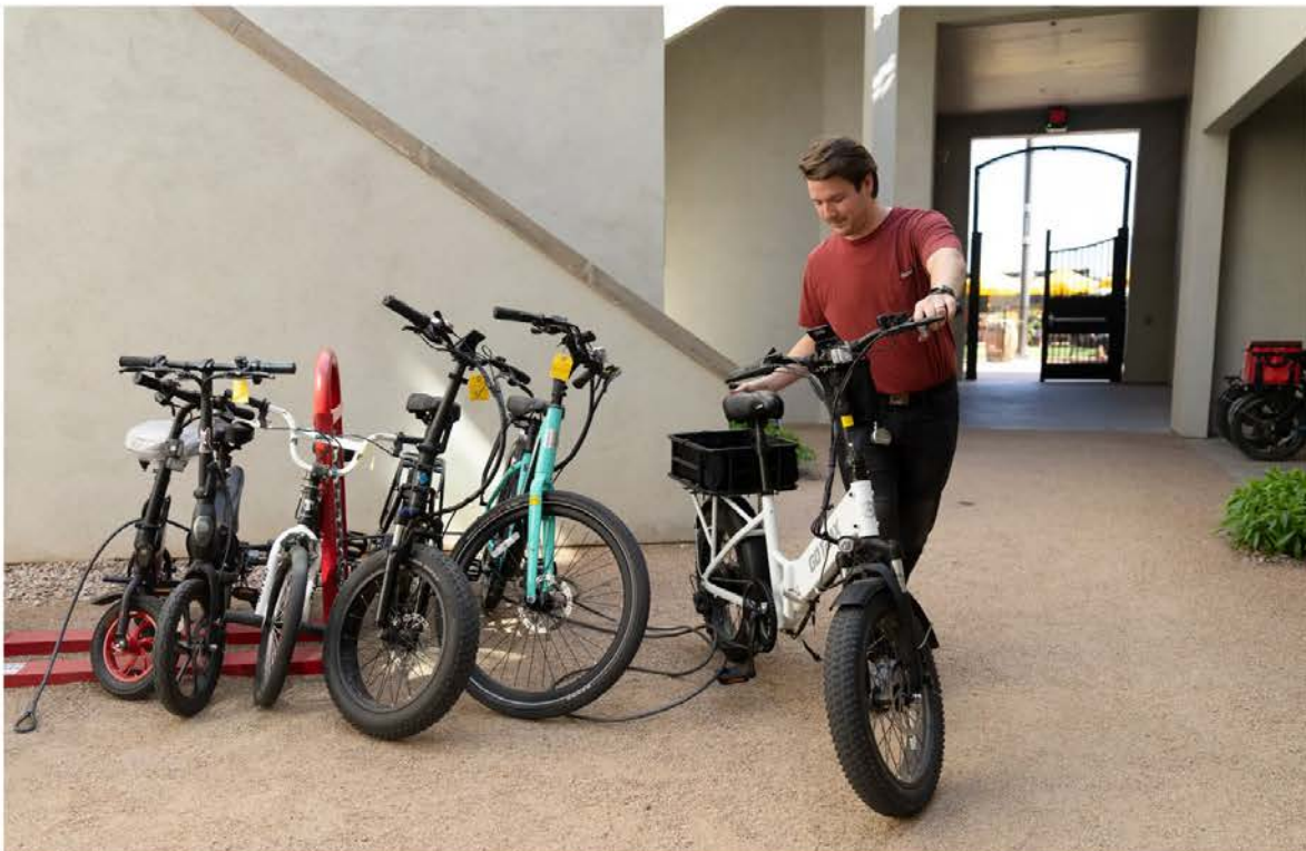
Electric bikes are popular in the community.

Culdesac's two- and three-story buildings are designed for the desert climate, painted bright white to reflect heat. Not having to factor in residential parking allowed its architects to configure buildings to maximize shade and to design narrow pathways that encouraged breezes and social engagement.