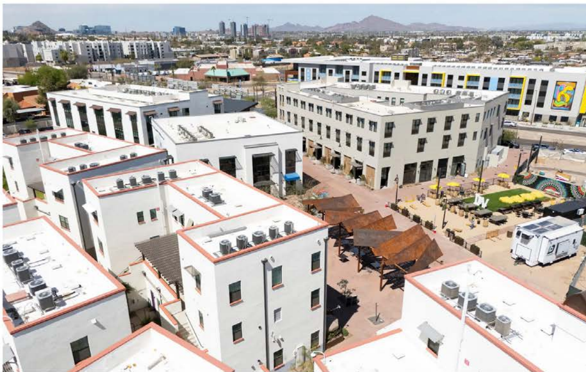
So far, 288 apartments have been built on eight of the site’s 17 acres. More units are planned.