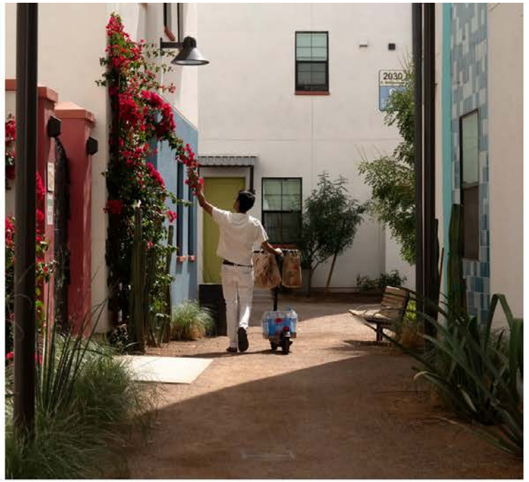
A resident of Culdesac Tempe walked his e-scooter after a grocery run.

One community near Phoenix is taking a “completely different” approach to development.